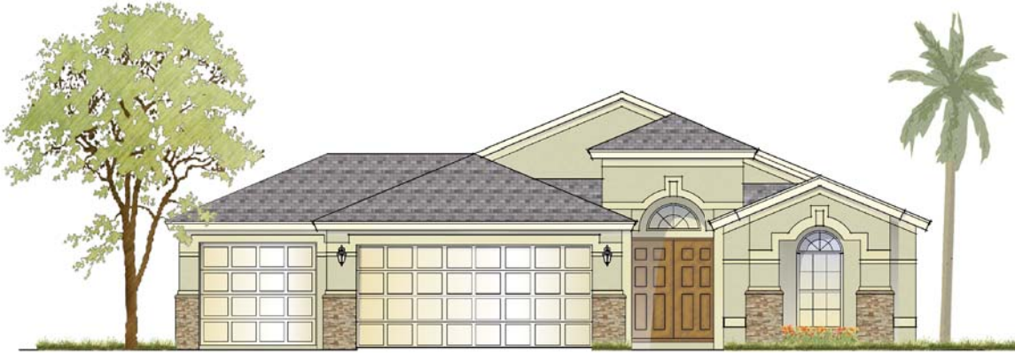
Elevation A 3 Car Garage