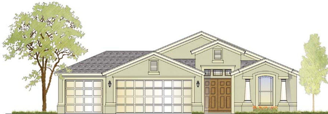
Elevation B 3 Car Garage